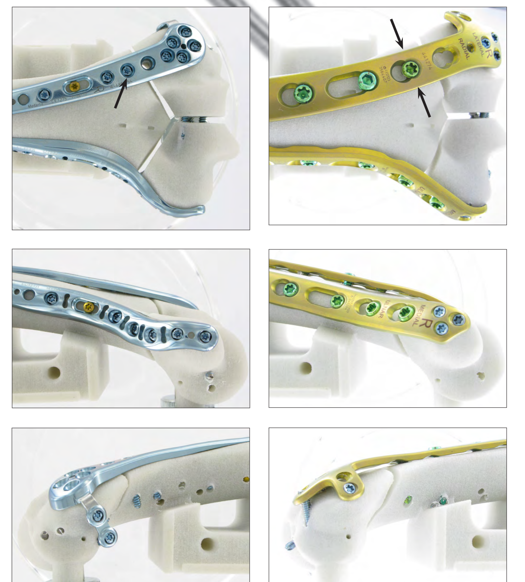
Figure 1: Constructs used for biomechanical testing (left: Medartis, right: Competitor); arrows indicate typical failure sites