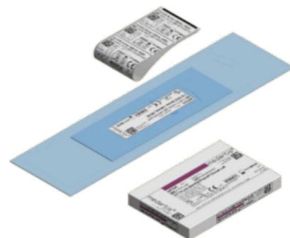
Pouch type packaging with labels, sealed pouches and cardboard box