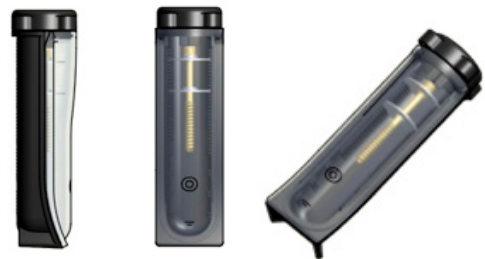
Inner injection molded tube