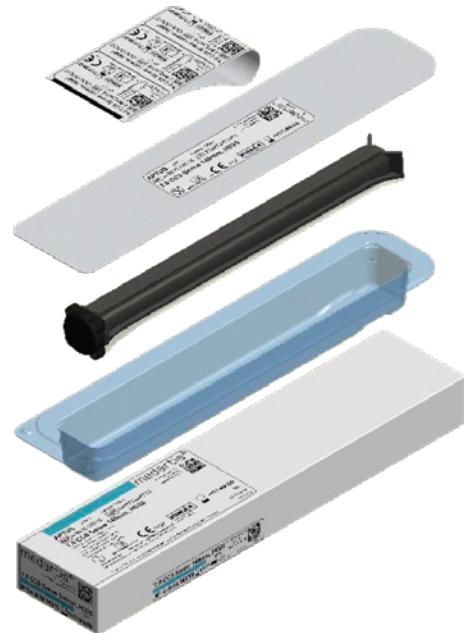
Blister type packaging with labels, tubes, blister and cardboard box